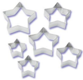
Cookie Cutters –used to make shapes out of cookies, Jell-o, etc