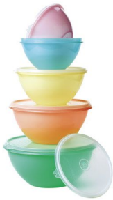
Tupperware – plastic containers with lids used to store extra food