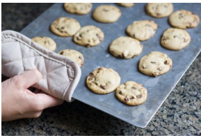
Cookie Sheet – flat, metal pan used to bake cookies, bread ...