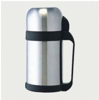
Thermos – an insulated cup used to keep drinks hot or cold